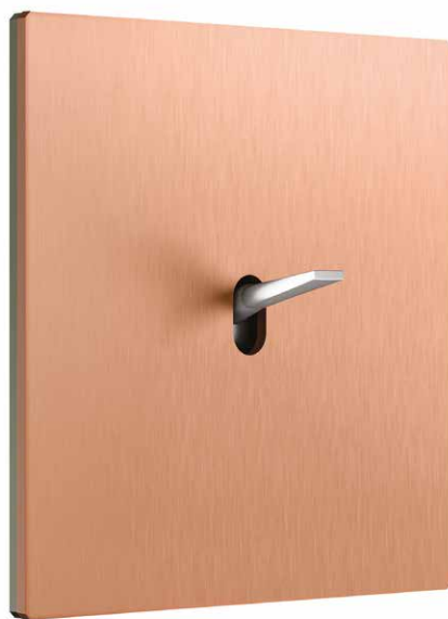
PLATE MATT COPPER BRASS TOGGLE CHROME PLATED