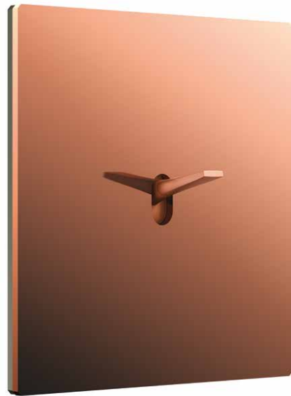
PLATE & TOGGLE BRIGHT COPPER BRASS