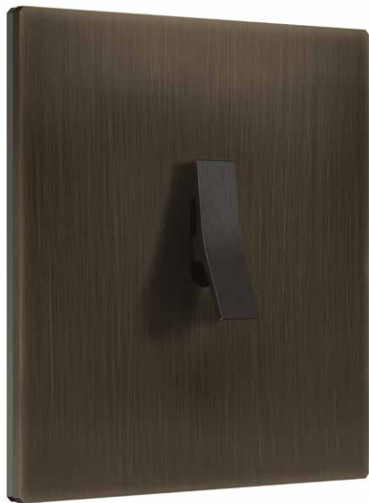
PLATE ANTIQUE BRONZE IRON TOGGLE MATT BLACK