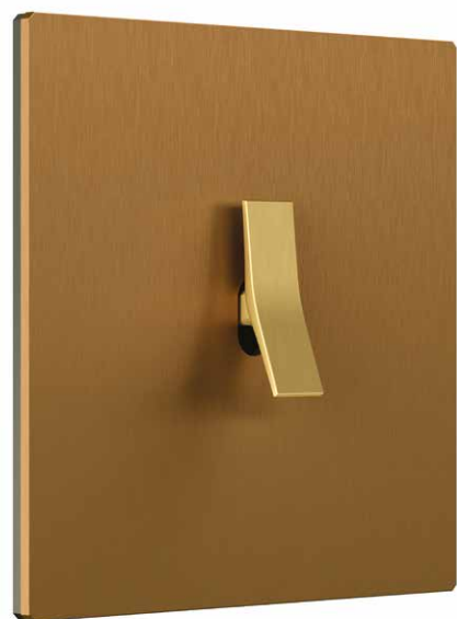
PLATE MATT BRONZE BRASS TOGGLE MATT GOLDEN