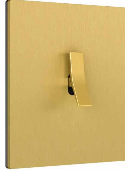
PLATE BRUSHED GOLDEN BRASS TOGGLE MATT GOLDEN