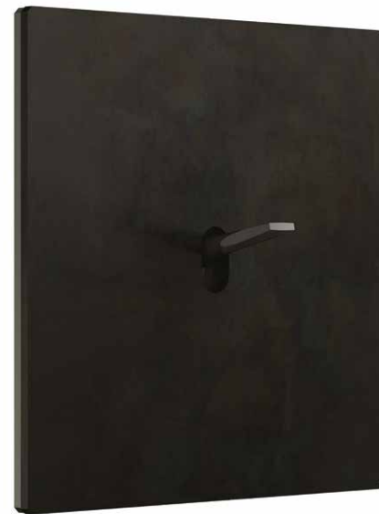
PLATE BRÛLÉ IRON TOGGLE BLACK NICKEL