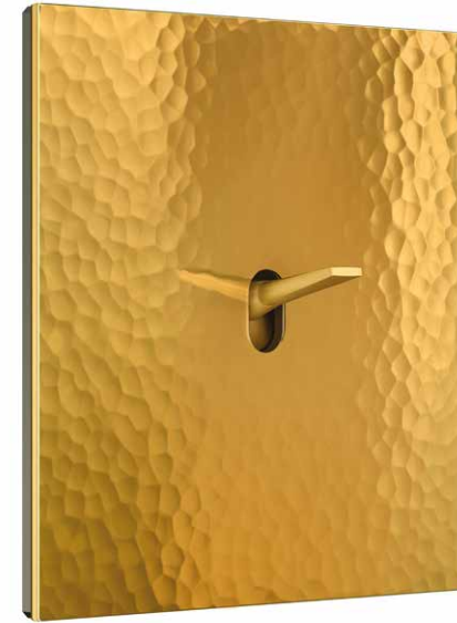
PLATE MARTELÉ GOLDEN BRASS TOGGLE MATT GOLDEN